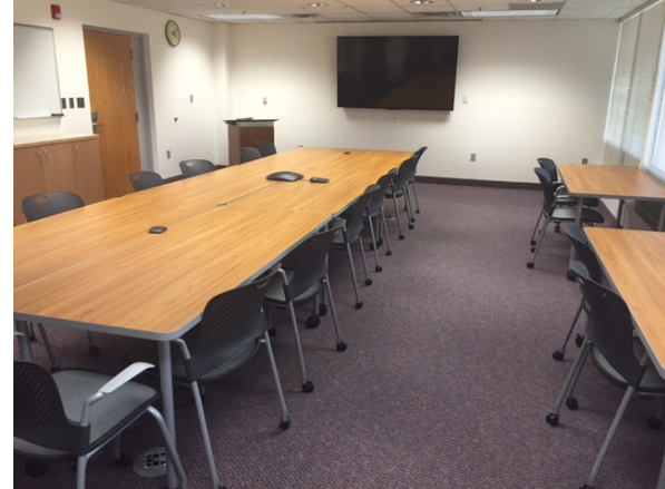
Conference Room for IDR Planning